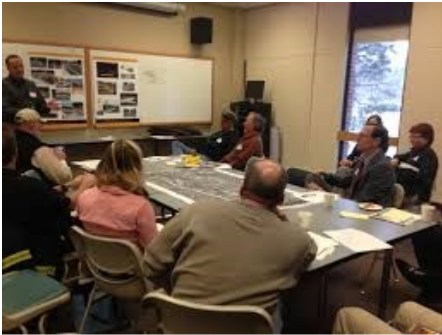
Many focus group discussions will be professionally facilitated